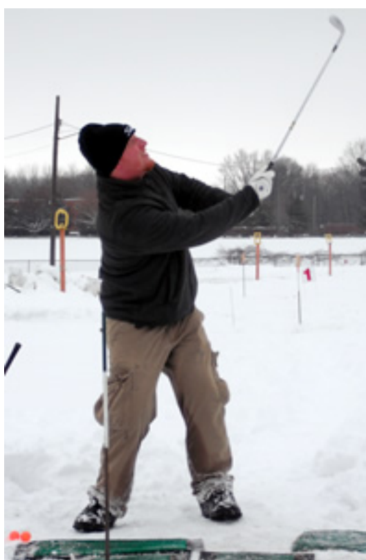
Golfers enjoy a cold, but fun, day at the Strongsville Chili Open!

February 27th also marked the 19th Annual Chili Open sponsored by the Rotary of Strongsville. Over 800 guests attended this year's event -- 300 of which golfed on a snowy golf course at the Cuyahoga County Fairgrounds. A portion of proceeds will benefit RMH -- thank you Strongsville Rotary!