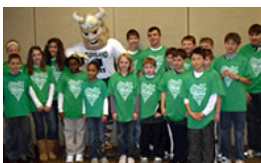
Kids at the Best to Better Event with CSU Viking, Magnus.