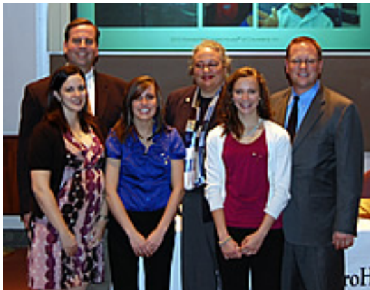
House Hero Alpha Delta Pi.