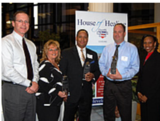
Pillar Award Winner BJ's Wholesale.

RMH presented three Pillar Awards that evening. The Pillar Award is given to companies, foundations and individuals who have given consistently, generously and thoughtfully to the House on a long-term basis. This year's winners were: