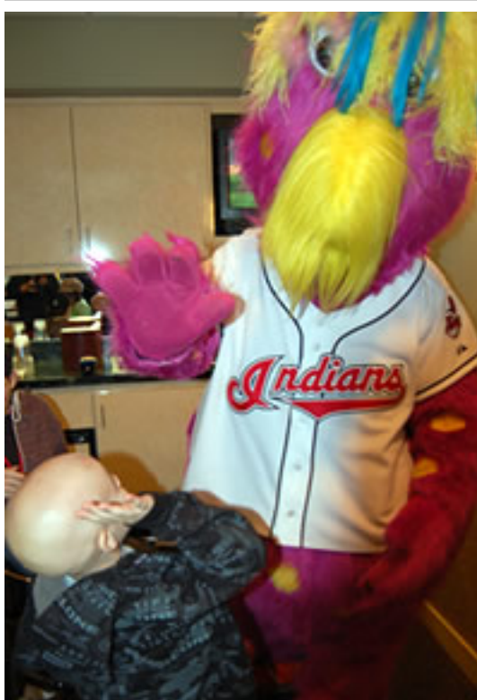
Families got a special visit from Slider at the Tribe game in Fairmount Minerals' Suite.

Fairmount Minerals also often provides their private loge at Progressive Field for our families to enjoy. Last month, ten RMH guests were able to watch the Tribe play the White Sox from this incredible venue -- plus, Slider came and visited -- it was a night to remember. Thank you, Fairmount Minerals, for your ongoing, stellar support!