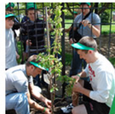
Children's Garden Area. Planting the new tree.